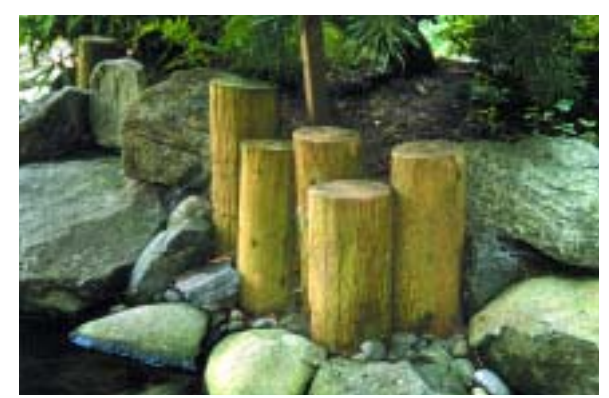
Linda Montgomery's gardening passion includes a delightful sense of detail.