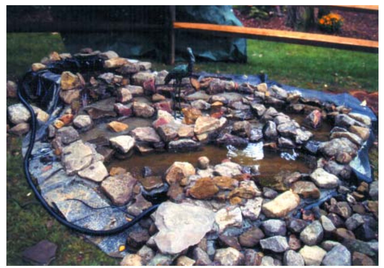
The plumbing from the submersible pump in the hidden reservoir would be buried to the entry point at the top of bird pond.

into the wet sandmix. Hydrolic cement, which sets rapidly, was used to glue down final small pieces of sandstone and gravel for permanent, finishing detail. Around the perimeter of the birdbath, I folded the excess liner up above the water level to ensure prevention of future water loss and then built an outside stone wall to hide both the concrete framework and the liner. Because of the shady site, plush moss will grow on the damp sandstone, adding color and detail.