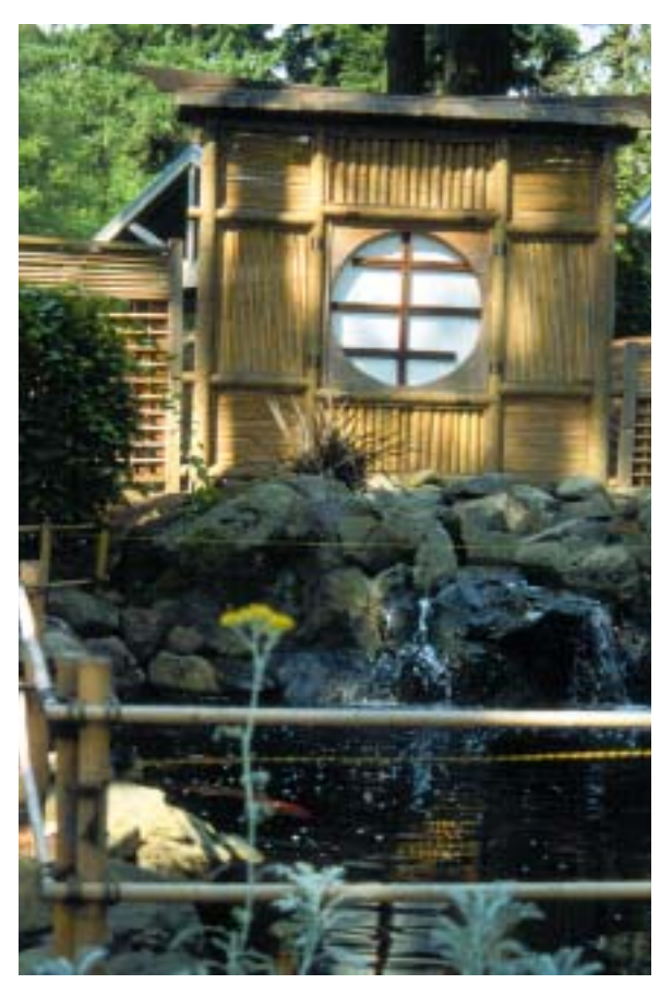
A garden path leads up the Bollers' hill to a second Koi pond set in front of a Japanese tea house. Inconspicuous fishing line is strung across the pond to discourage herons.