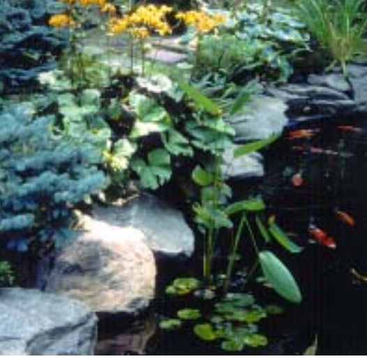
The Montgomery's lower Koi pond takes up most of the lower backyard