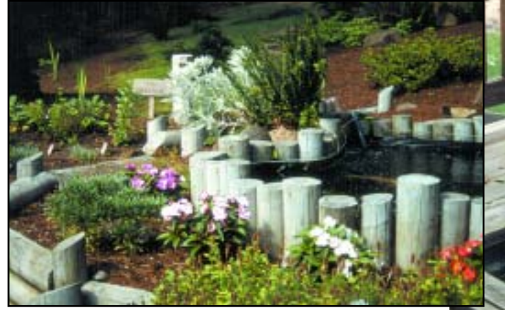
Japanese-styled post edging frames the lower Koi pond. The posts are set above the water level of the rubber-lined pond so that no sharp edges within the pond can harm the special pets.