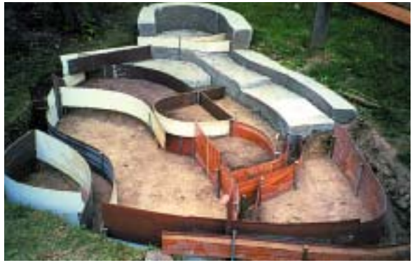
Flexible and thin wall panels were used to create forms for the concrete base

The second main course would flow towards the foreground, also branching in different directions from different planes. Both courses would travel around a central raised area or island. This island would later support a statue. Down stream, all branches or rivulets would meet in the lowest shallow pool and disappear under a pile of rockwork. A hidden well would