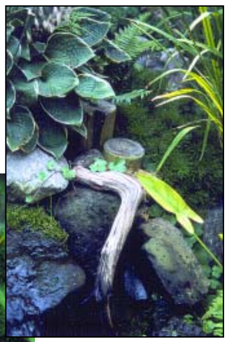
Using a variety of sizes of rocks creates a stream of natural beauty.