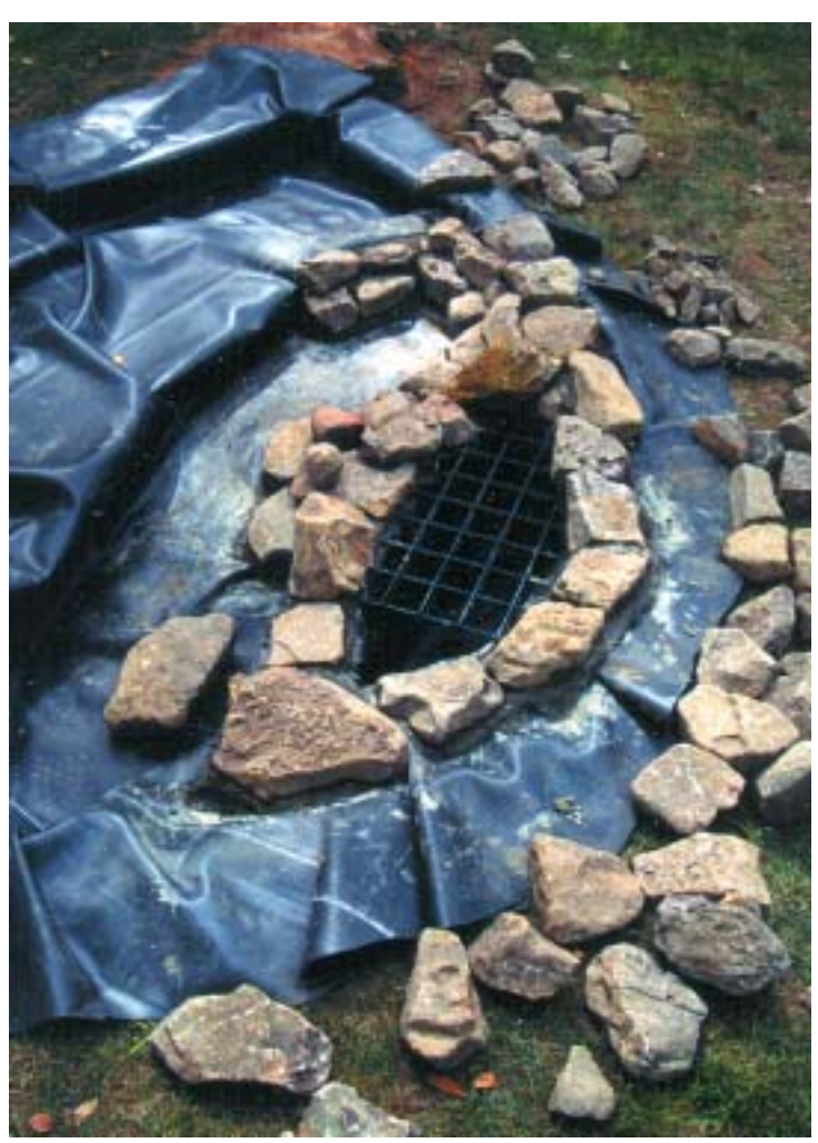
(above) Because the shallow bird pond covers about 80 square feet, a 50-gallon, hidden reservoir will provide the water source.

Finally, the basic construction was ready for the exterior stonework. Rock selection and placement became critical. Sandstone was chosen. The rocks ranged in color tone: gray, tanbeige-brown, golden-orange-yellow, and red. Many of the rocks had surface patterns like pock marks or grooves that would be purposefully placed to best display its best side. Even small rocks had a reason behind their selection and placement. They would act as hundreds of perches for the birds. The best way I can describe this is to call the birdbath a custom painting on the ground, rich in texture and