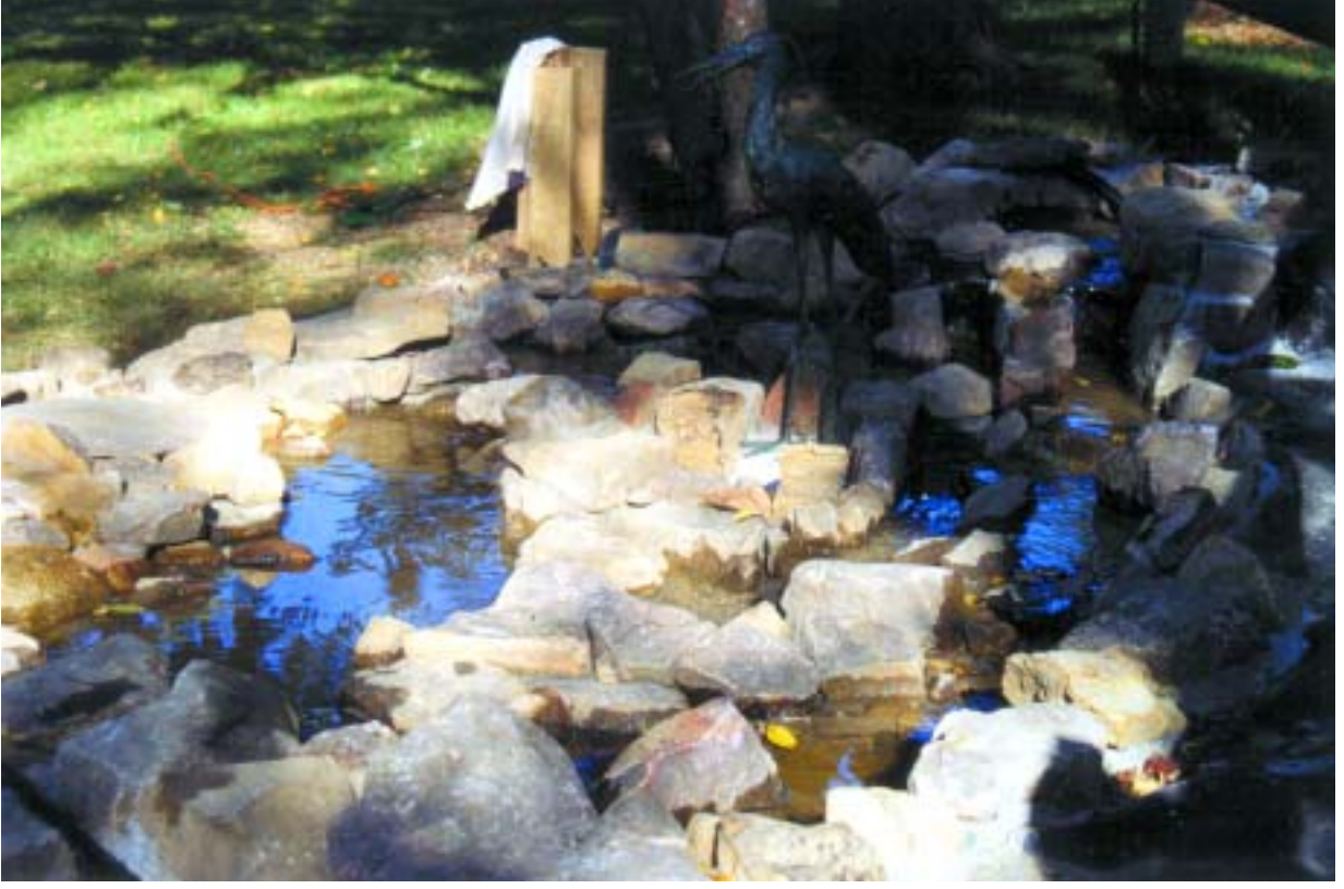
In operation, the completed bird pond offers many shallow ba drink from the gently flowing water.

With the custom birdbath construction finished, I filled the system with a garden hose and plugged in the pump. The running effect was