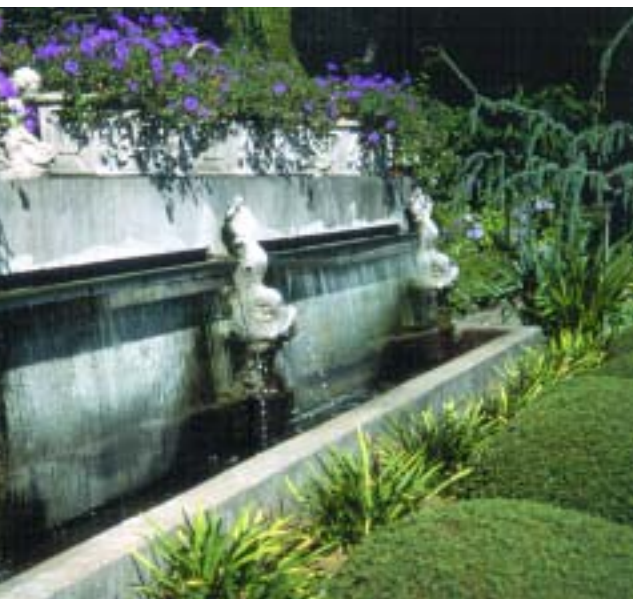
Part of the Koi pond area is this elegant formal waterfall display.