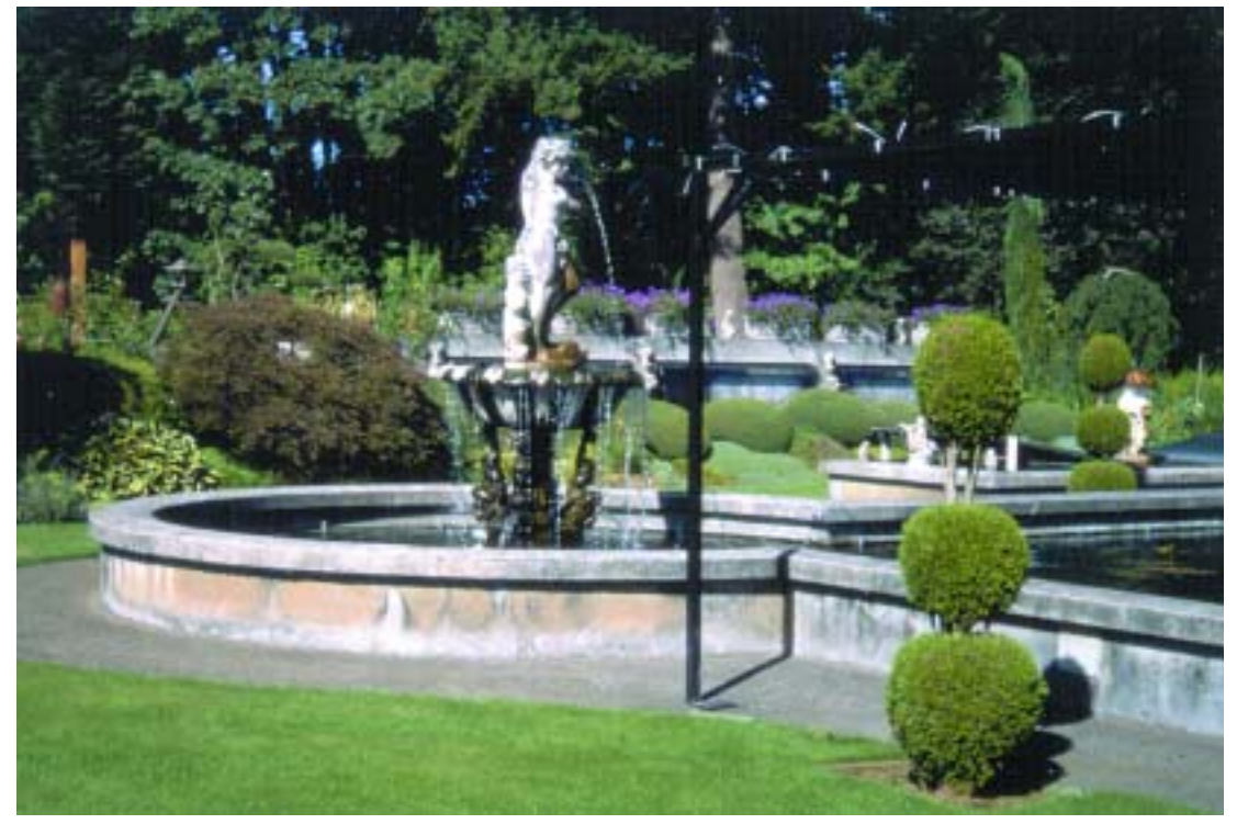
Morris and Jeanie Bush take their Koi very seriously. Their formal Koi pond includes a shade-cloth protection to preserve the Koi's colors and to conceal them from herons flying overhead.