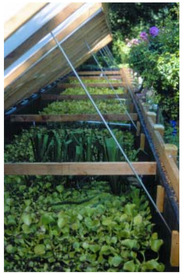
Part of the extensive filtration provided for the Bushes' Koi ponds is this long vegetable filter filled with nutrient-removing water hyacinths. The clear overhead panels can be lowered in cooler weather to extend the growing season of the tropical plants.