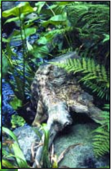
Driftwood combines with rocks, ferns, and shade-loving hostas to create design detail in the shady portion of the stream.