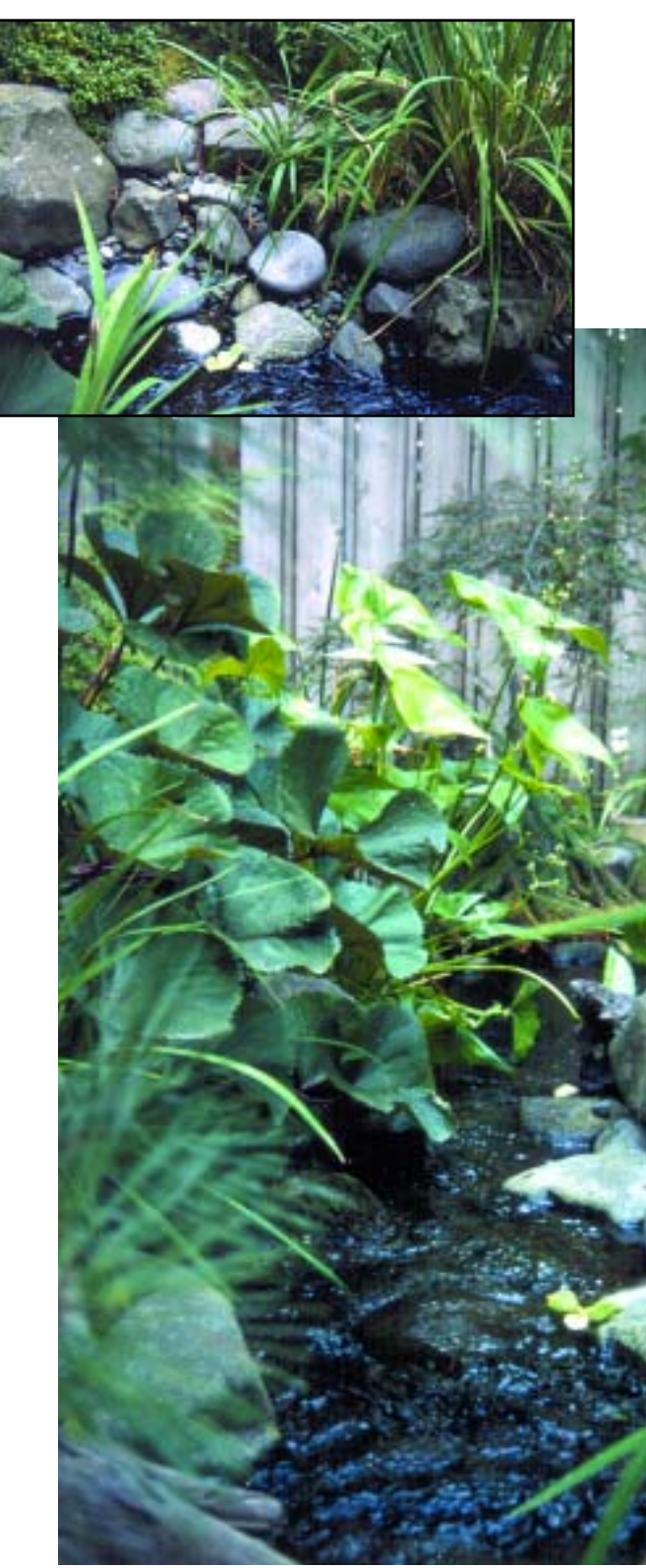
Linda and Bill's garden stream could be a water feature of its own, but it connects the two Koi ponds.