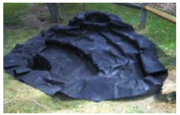
A geotextile fabric protects the liner for the long life of the pond construction.

ing material for the concrete needed to be both thin and flexible. Old paneling worked perfectly for this detailed application.