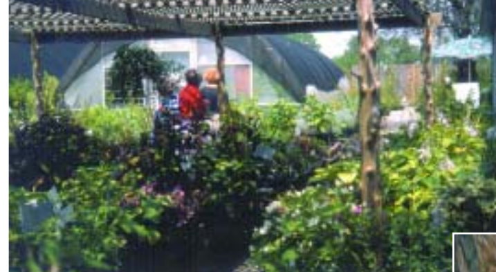
Part of the Farm's herb sales are set up under lattices to create the partial shade required by some plants.

pots, while still blooming. Always be suspicious of such chemical enhancements when you see a uniform flat of flowers, all in bloom, but with the plants small in size. We feel these treatments particularly affect the ultimate size of annuals.