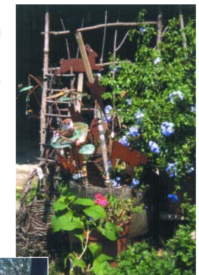
Outside one of the gift shops, a collection of barrels and "primitive" farm implements showcase native plants and herbs.

Our philosophy of gardening is to live naturally. Consequently, we try to be as organic as possible and use beneficial insects in the greenhouses. Many times we are told that plants purchased here grow better. We tell customers that we do not use growth retardants that are widely used in commercial greenhouses. What amazes me is that, unless the sellers grow the plants themselves, they have no idea that the plants are treated. The reason plants are treated is to prolong the shelf life of the plant. Because growth retardants keep the plants small, they can be kept in smaller and more economical