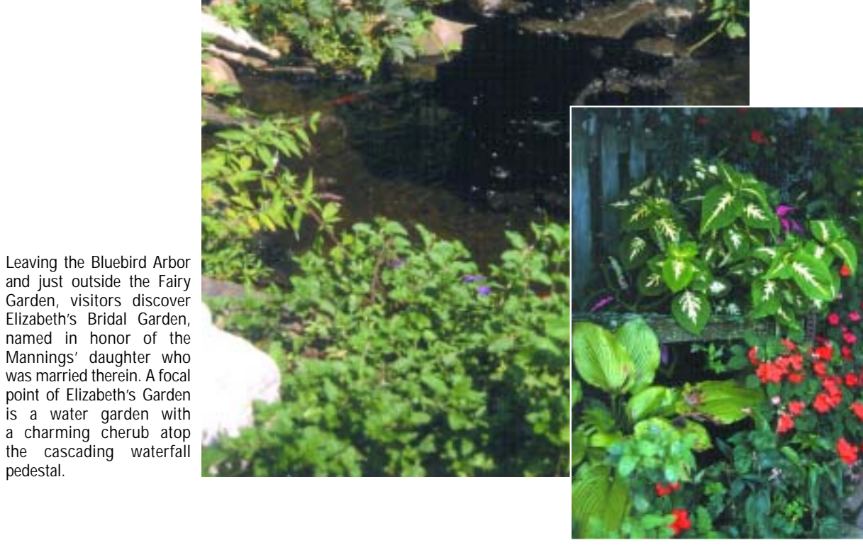
A gardener's treat is to note the various plant combinations throughout the gardens. This shady nook demonstrates that color and texture are possible even under minimal light conditions. The three herbs Betty recommends for planting around a pond are old-fashioned roses for scent and lavender and thyme for color and texture. Inside the pond? She recommends mint and horsetail (Equisetum)!

I tend to let things grow together, but that's my style. I like for everything to look natural, and I don't get into a fuss about it. If the bugs eat them, I let them eat.