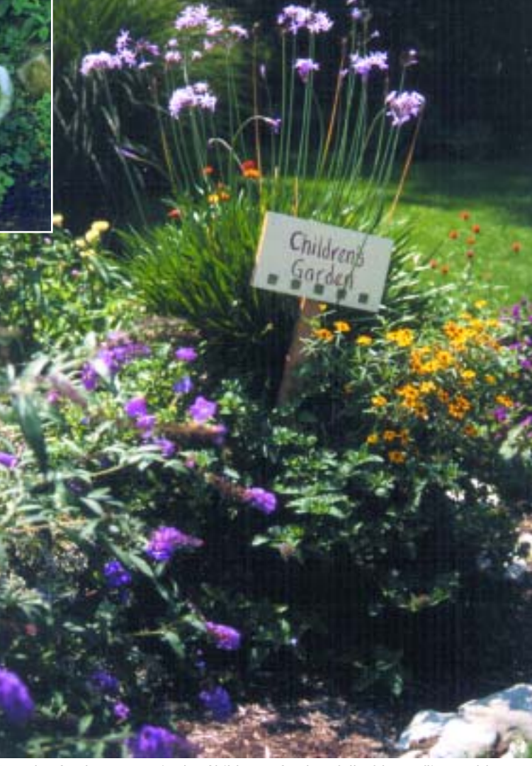
Near the Garden's entry is the Children's Garden, full of butterflies and bees collecting fragrant nectar. Betty notes children especially enjoy sunflowers, scented geraniums, thyme (for fairies!), and morning glories. Area children, visiting the Farm for Betty's newest project, a children's garden club, also enjoy the pettable goats.

The Fairy Garden is beloved of both adults and children. A stream, watched over by statues of fairies and angels, begins its winding path through the garden where it disappears in the shady border to reappear under a bridge and mingle with the waters of the lily pond.