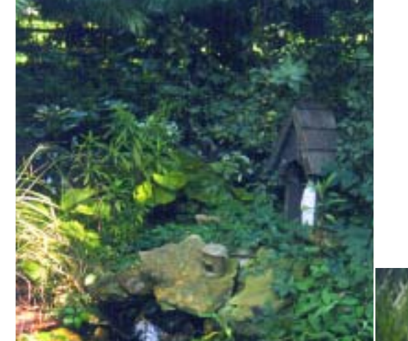
You involve children in gardens by planting herbs and flowers that have stories associated with them. -Betsy Williams, herbalist and garden writer

The Fairy Garden is beloved of both adults and children. A stream, watched over by statues of fairies and angels, begins its winding path through the garden where it disappears in the shady border to reappear under a bridge and mingle with the waters of the lily pond.