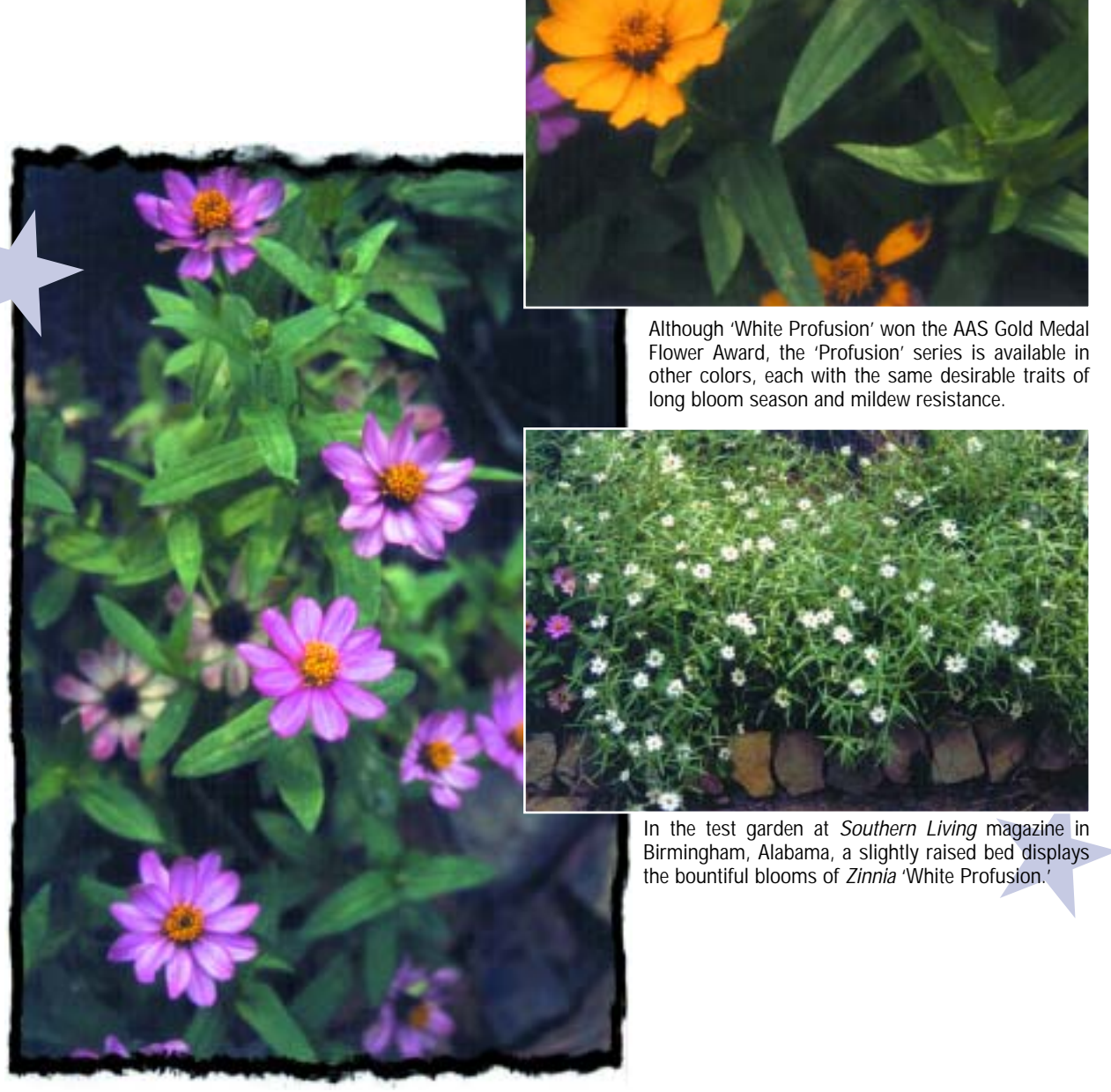
The pink form of the Zinnia 'Profusion' series lives up to its name.